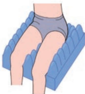
Figure 6. Patient properly immersed within the cushion.