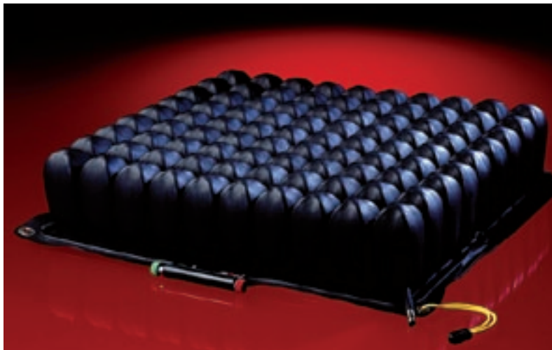
Figure 1. ROHO Quadtro cushion employs Dry Floatation technology.