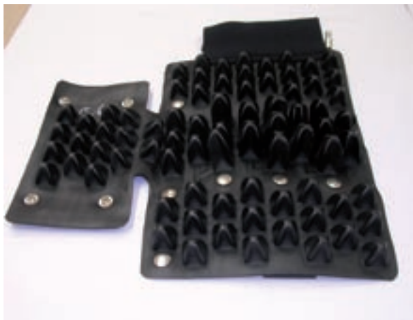
Figure 2. ROHO Heel protectors.