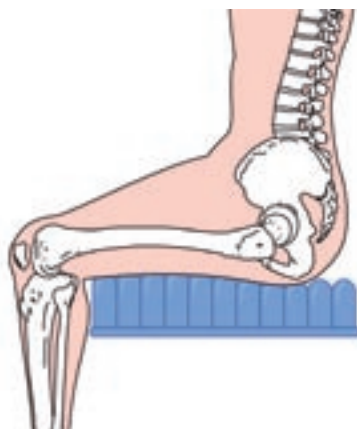
Figure 3. Properly seated patient.