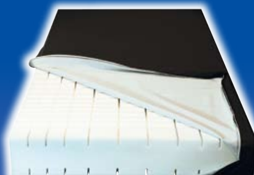
Viscotech ® Community - Medium Risk