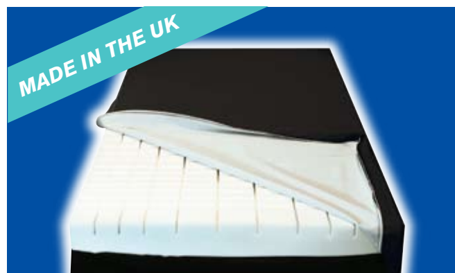
Viscotech ® Community - High Risk

Sumed International (UK) Ltd Integrity House Units 1-2 Graphite Way Hadfield, Glossop Derbyshire SK13 1QH Phone: 01457 890980 Fax: 01457 890990 E-mail: sales@sumed.co.uk www.sumed.co.uk